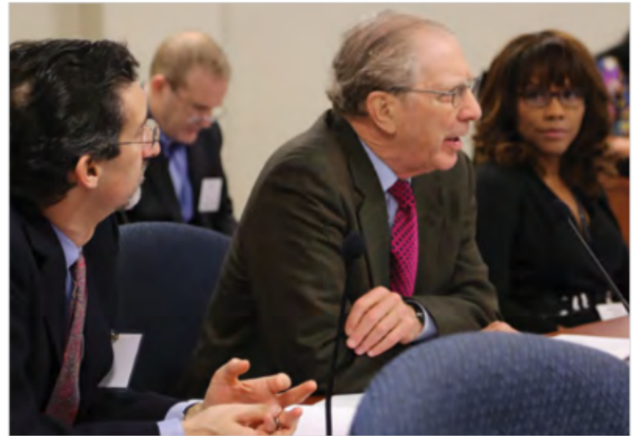
Pierre N. Leval of the U.S. Court of Appeals, Second Circuit